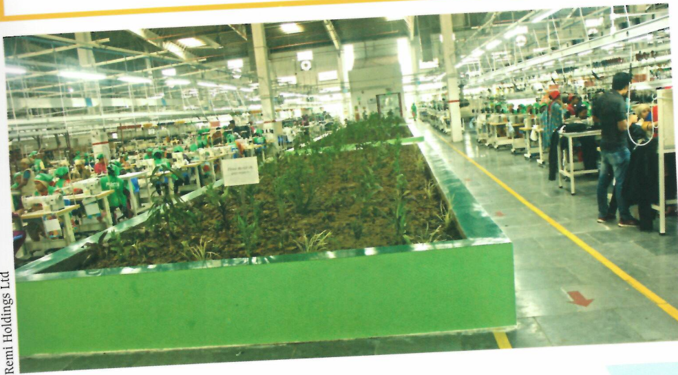
Remi Holdings Ltd

geographic clusters to reduce their water footprint through (a) enhancement of water resource management, (b) adoption of low-cost/no-cost Cleaner Production practices, and (c) investments in technologies that significantly reduce water consumption and effluent. So far 162 wet processing factories have been engaged in the project. To encourage its members to adopt good environmental practices, BGMEA in collaboration with the GIZ also started award