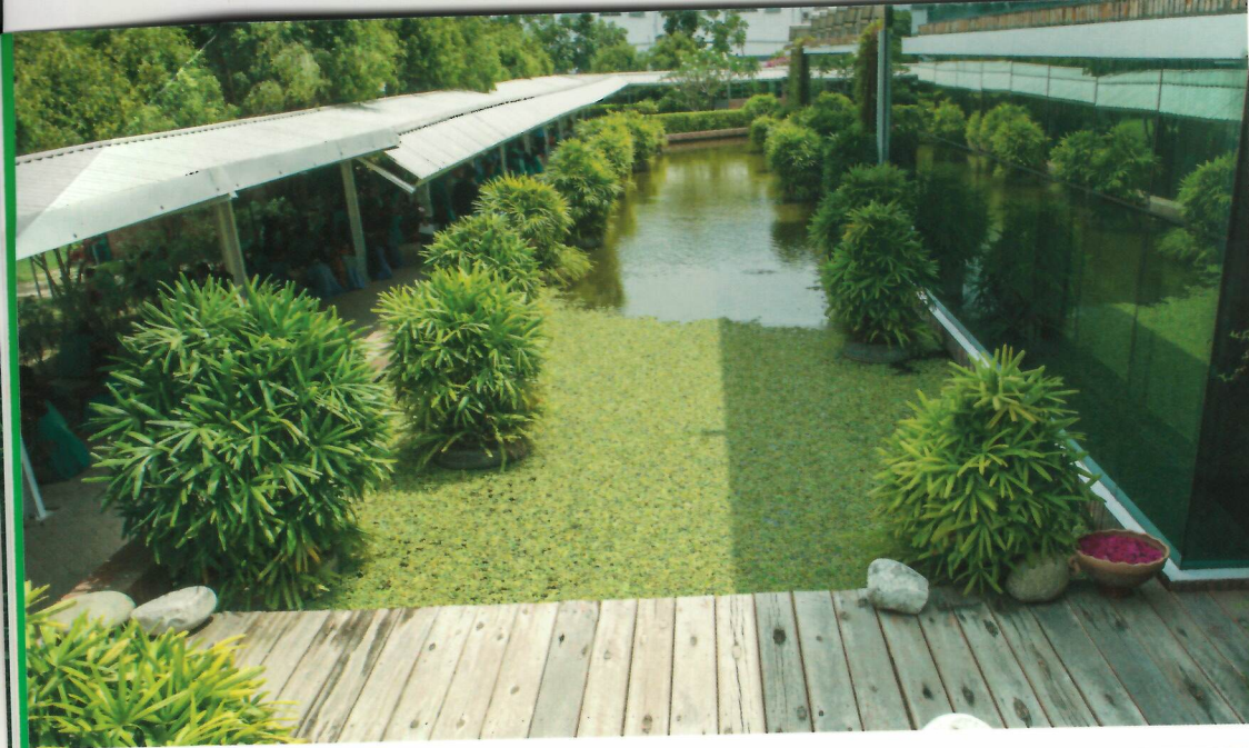
Vintage Denim Studio

Among the top 10 highest rated apparel factories in the world at least four are originated from Bangladesh. Remi Holdings Ltd, a sister concern of the Bitopi group has recently achieved LEED Platinum certification under the category LEED: BD+C: New Construction, with a score of 97 points, making it the highest rated green RMG factory in the world. The highest rated LEED Platinum washing plant in the world namely Genesis